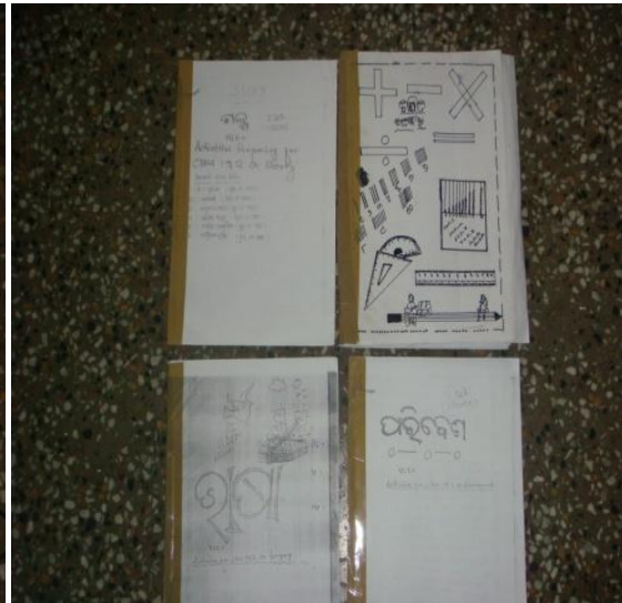
Figures 2 & 3: Activity Books on Mathematics (left), Language and EVS for Class1