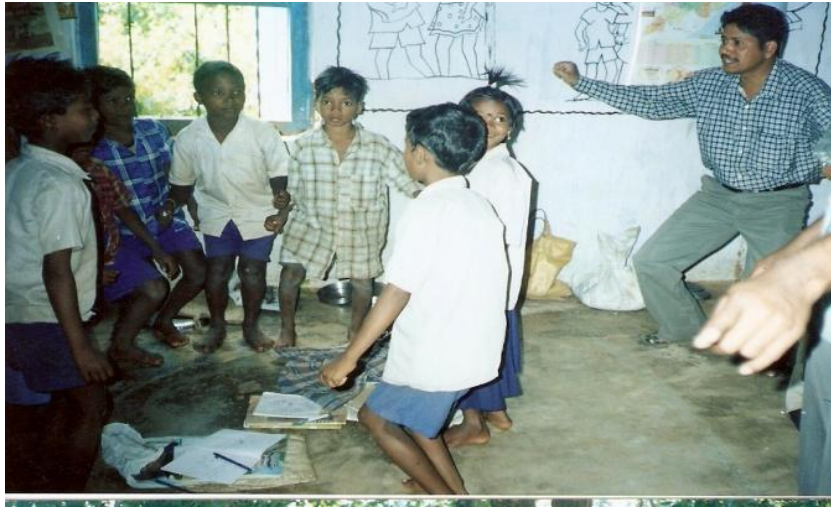
Figure 1: MLE teacher trying out an activity in Saora Language in class II

Contains 15 activities. These activities were developed by the MLE teachers and CMWs.