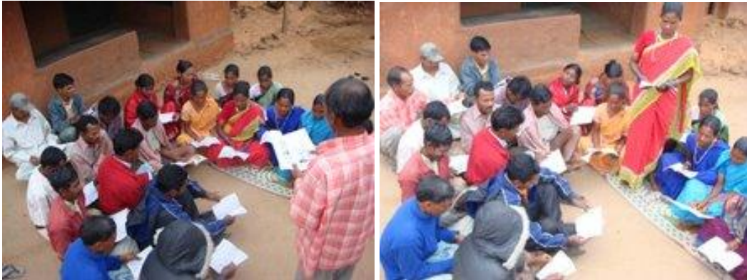
Figures 4 & 5: A Community Library Activity