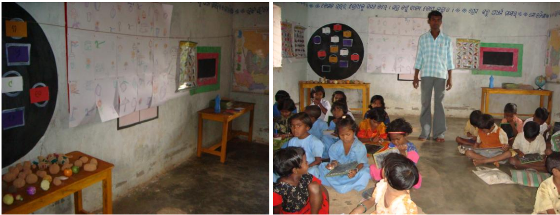
Figures 6 & 7: Science and Math Corner in MLE+ Classroom